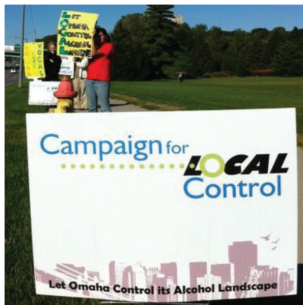
Local groups in Omaha launched a campaign to propose a new zoning ordinance to give Omaha authority to make its own alcohol licensing decisions

To be successful, the citizen voice of the community must be organized. It represents democracy in action and relies on one of the core tenets of our country’s political system, that elected officials are accountable to those who elected them. Unless the citizen voice is heard, more traditional constituencies with economic clout and with the ear of decision makers are more likely to be able to sway policy decisions, even when their proposals