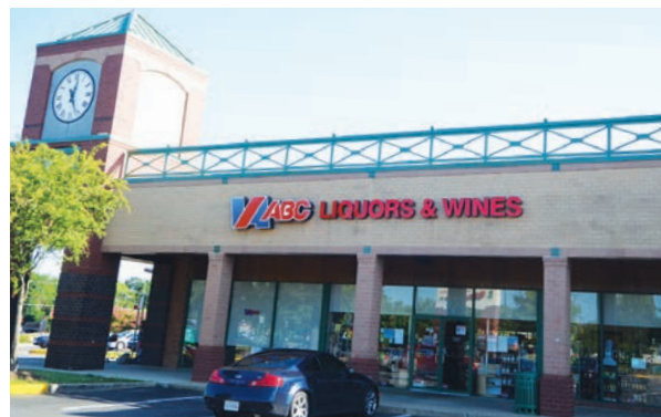
18 states have state-run alcohol retail or wholesale operations

There are 18 Control States , where the state itself sells alcoholic beverages in off-premises, retail or wholesale settings. All of these 18 Control States were organized after Prohibition and all originally operated off-sale retail “state stores,” in some cases to the exclusion of private retailers. (No Control State operates on-sale premises.) There has been